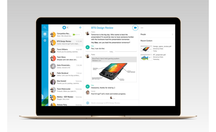
Figure 1. Cisco Spark Room