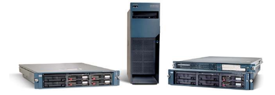
Figure 1. Cisco Unified Mobility with Cisco 7800 Series Media Convergence Server Communications Manager Appliances

Cisco Unified Mobility makes it easy for enterprise workers to keep in touch with the business at hand, whether at their desks or mobile. It introduces Cisco Mobile Connect enterprise mobility services to extend the benefits of IP communications to workers inside and outside the enterprise campus. An application server that integrates with Cisco Unified Communications Manager, Cisco Unified Mobility intelligently manages, filters, routes, and places calls between a worker's IP phone and remote mobile phone. With Cisco Unified Mobility, a worker can receive and place business calls from the devices most convenient for the task without interrupting the calls, whether in the office, in transit, or at a remote location. Cisco Unified Mobility also helps enterprise IT and telecom managers better serve the communication needs of their mobile workers, while enabling them to take advantage of the enterprise IP communications network resources available with Cisco Unified Communications Manager. Cisco Unified Mobility is installed on the Cisco 7800 Series Media Convergence Server (MCS) Communications Manager Appliances (Figure 1).