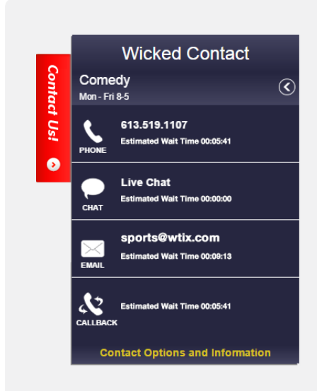
Web Chat "Contact Us" Example

With MiContact Center Multimedia, not only do customers have a seamless experience between all media channels, but so do agents. On the desktop, contact center agents use the Mitel Ignite client, a single application designed to handle all digital customer interactions. From Ignite, agents can receive multimedia queries through ACD-like routing algorithms, such as Longest Idle Agent or Most Skilled Agent, but they also have the ability to see contacts waiting in queue and dynamically select these to be answered.